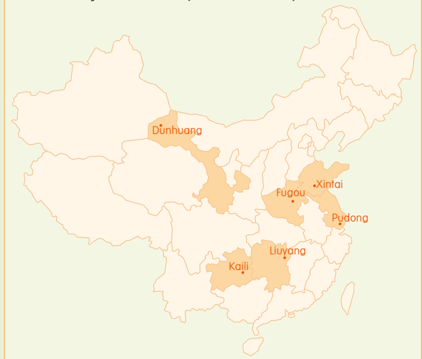
Project Location (counties/cities) in China

The needs of old persons with psychological and mental disorders, the provision of psychological consultation to old persons.