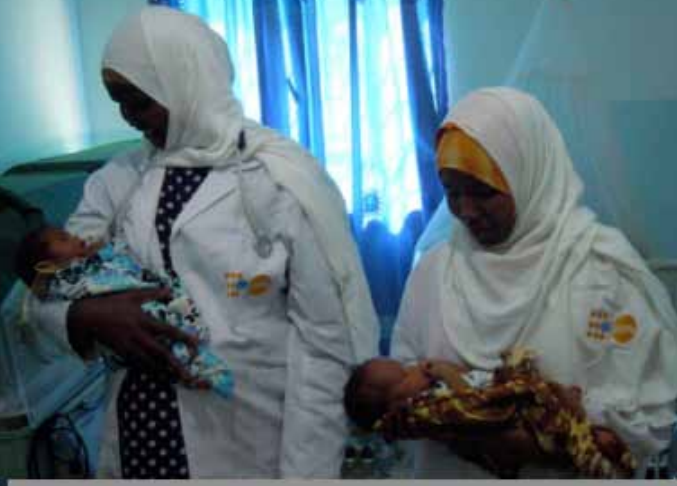
Practical and Theoritical training during Basic Emergency Obstetric Care course at Galkayo medical center.