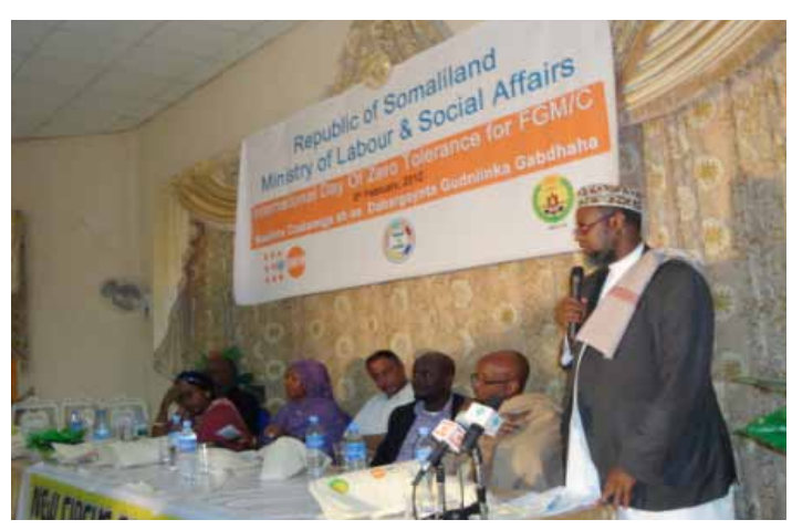
Minister of Religion, Sheikh Khalil addressing the FGM/C Commemoration

In Galkayo, over 60 persons attended the commemoration with invited guest speakers from Galmudug Authority, Women Focal Point and religious elders. The event was followed by radio debates regarding the consequences of FGM for during and after