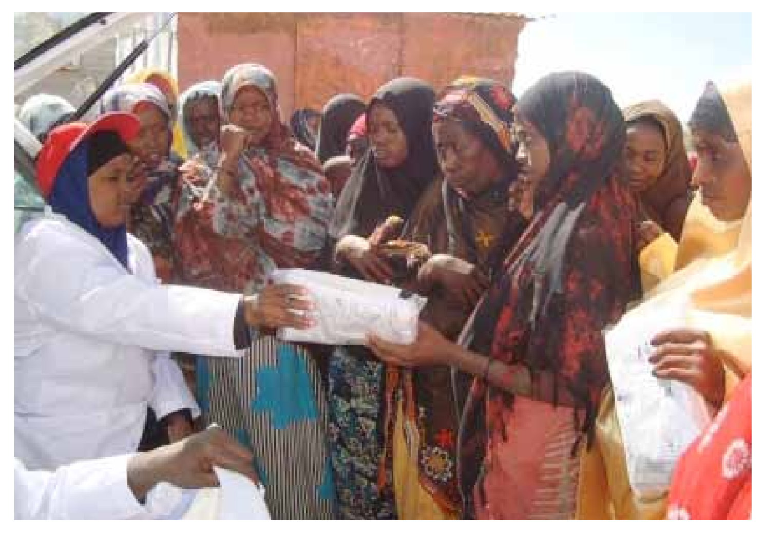
Internally Displaced People (IDP)in Galkayo received Clean Delivery Kits from UNFPA.

In addition, according to SBACO, they have documented 154 cases of deliveries. Eight cases of complicated deliveries were referred to Galkayo Medical Center for further medical support. Antenatal care for were given for 862 mothers.