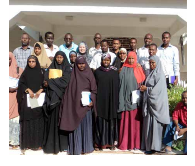
Group photo of participants. .

23 nurses from MCH's in Banadir region and Mogadishu were given training in Clinical Management of Rape in mid-November, as a response to an increase in Gender Based Violence (GBV) cases in Mogadishu. This was the first time that members from the GBV Working Group in Mogadishu participated on this kind of training. The participants showed low knowledge related to treatment of sexual violence survivors as their understanding of post-exposure prophylaxis, emergency contraceptive pills, care, treatment and prevention of infections are very limited. The participants' average score on the pre-test was 23 % correct answers, while on the post test they scored an average of 83 %.